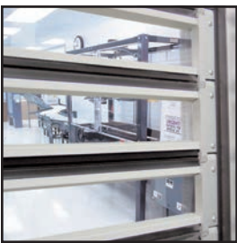
Nine inch high vision slats for increased visibility