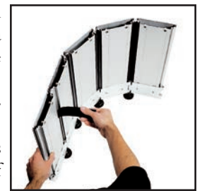
Integral rubber weatherseal