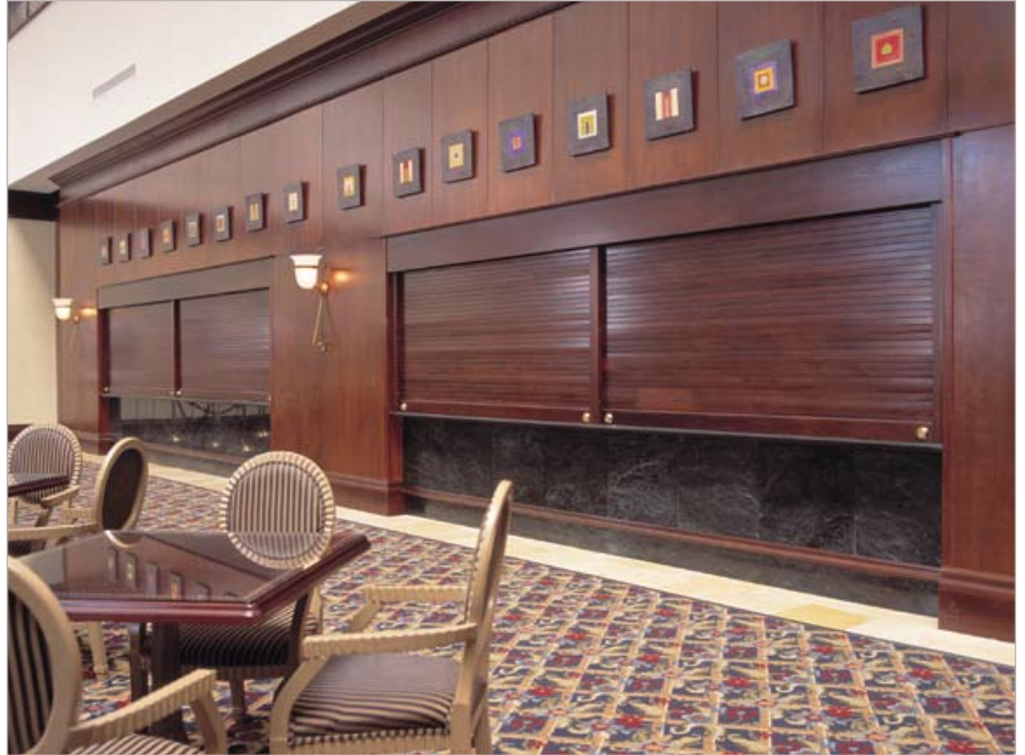
These custom stained Roll-up doors separate the breakfast dining area from the kitchen and adjacent sports bar of this luxury hotel.

* We can also build our Roll-Up doors in nearly any other hardwood you'd like. Call your distributor or our office.