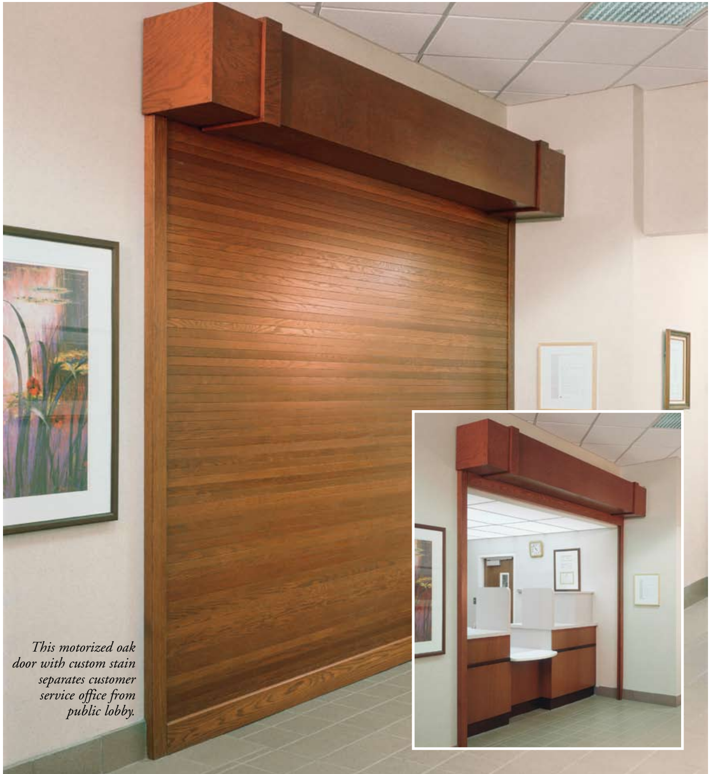
This motorized oak door with custom stain separates customer service office from public lobby.

door is installed and tested prior to shipping, then sent in durable crating, thus ensuring everything possible is done to have all pieces arrive undamaged.